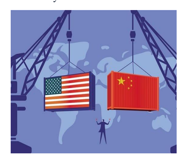
U.S. products. The trade conflict escalated, and subsequent

2. Tariffs and Trade War: In July 2018, the U.S. imposed tariffs on $34 billion worth of Chinese goods, triggering retaliatory tariffs from China on