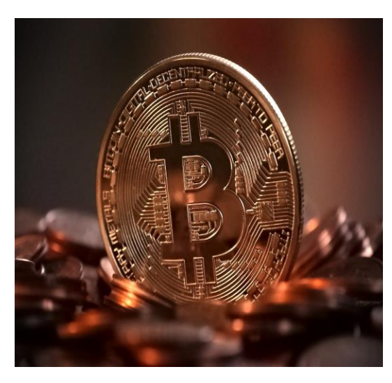
of Bitcoin and other

Market Volatility: November 2018 was marked by a significant decline in the price